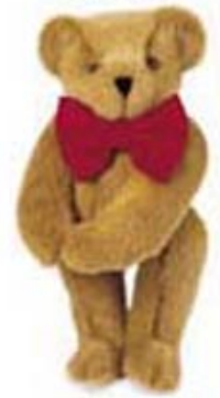
Vermont company sent 558 bears to families

company collected 150,000 messages of love and hope from people all over the country. Then they printed, and delivered the bounty of messages and bears with the help of Federal Express. An author of one of the cards admits, "When I left my own personal message for someone, I cried as I felt the love and energy that I was sharing would help another in some small way." New Yorkers are recovering with the help of their mayor and their governor who enlisted the highly profitable internet company, E-Bay, in the local aid effort. From now until the year's end, Auction for America is offering a free forum -- on E-Bay -- for sellers, participating companies, and celebrities to auction goods and services with full sales price donated to victims. Many U.S. Congressmen have donated themselves -- to act as chef, artist, tour guide or dinner host for winners.